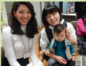
Introducing each other

You meet your Japanese family on April 21st (Saturday), 13:30~16:00 on the 11th floor of the Swing Bldg. You will be introduced to your family after a detailed explanation of the program. Students who join our program after September will be introduced on October 20th (Saturday), 14:15-15:30.