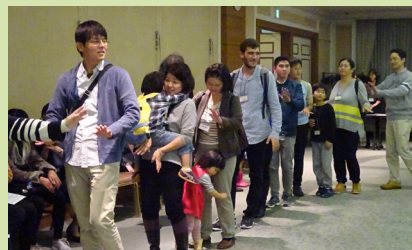
Bon dance The Musashino family exchange party 2017

The Musashino family exchange party for all the members in the program will be held on October 20th (Saturday), 15:30~17:00 on the 11 th floor of the Swing Bldg. This is a party for all the foreign students and families in the program. This is a good opportunity for you to get to know other members and to meet new friends.