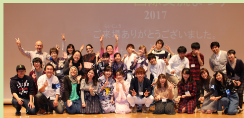
Many students helped show programs. Musashino International Festival 2017

Students help community FM program as a guest and an assistant.