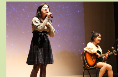
Students on the stage event Musashino International Festival 2017

The Musashino International Exchange Festival will be held on Nov. 3rd (Saturday), 11:00~17:00 at the Swing Bldg. This is MIA's biggest event held annually and an exhibition of all the activities and programs. You can come to the festival with your family or take part in the festival to introduce your own culture.