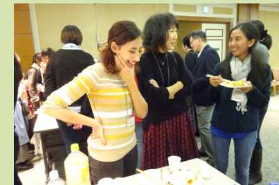
The Musashino family exchange party 2017