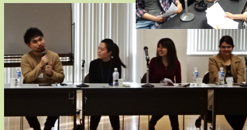
Students introduced what they had learnt from their student life in Japan at the lecture on February 2018.