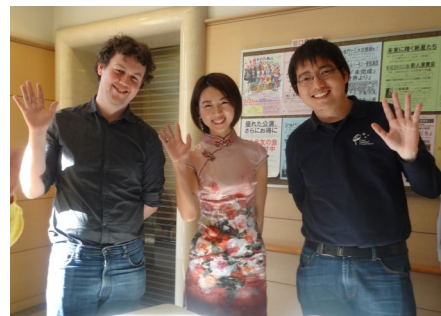
Smiles after the speech showcase last year!

* No booking is needed to hear the speeches on the day.