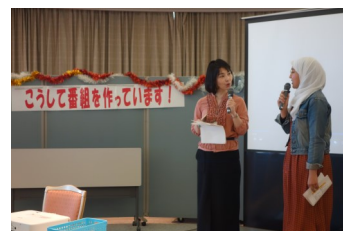
Musashino International Exchange Festival