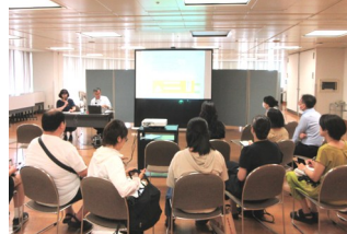
Let's listen to explanations, episodes, and ask questions