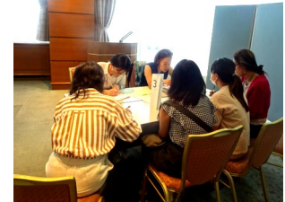
Individual consultations at the booth