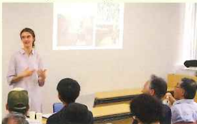
Introducing your hometown