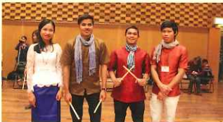
Dancing on the stage at festival

Let's get involved with the neighbors through volunteer activities at local schools, shopping streets and/or MIA. You can take part in a variety of activities. If you are interested in, please register as a volunteer.